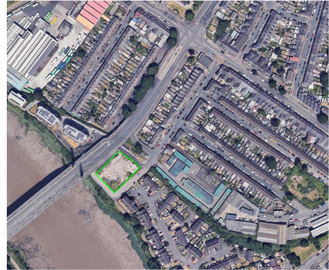
Aerial view of site (NTS) site boundary for information only

SITE ADDRESS: Coverack Road, Victoria, Newport Gwent, NP19 0QD,