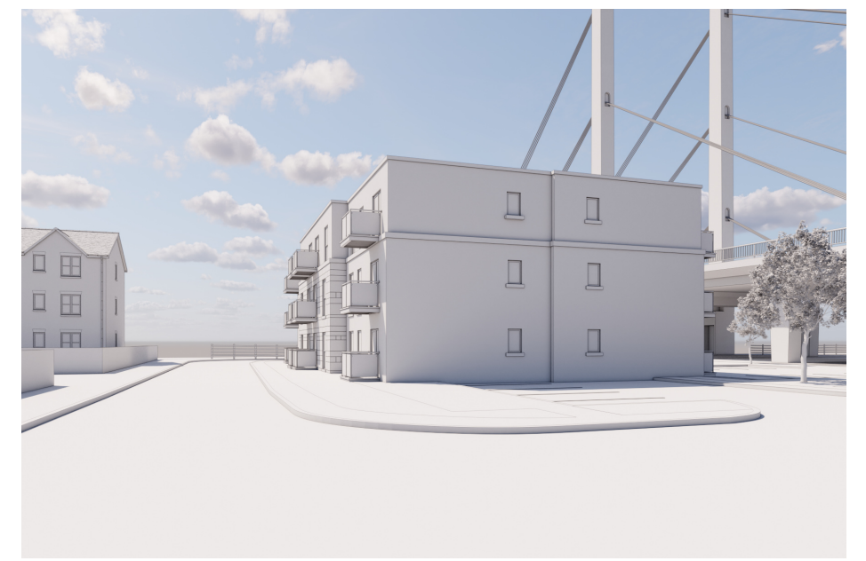
3 Storey comparison