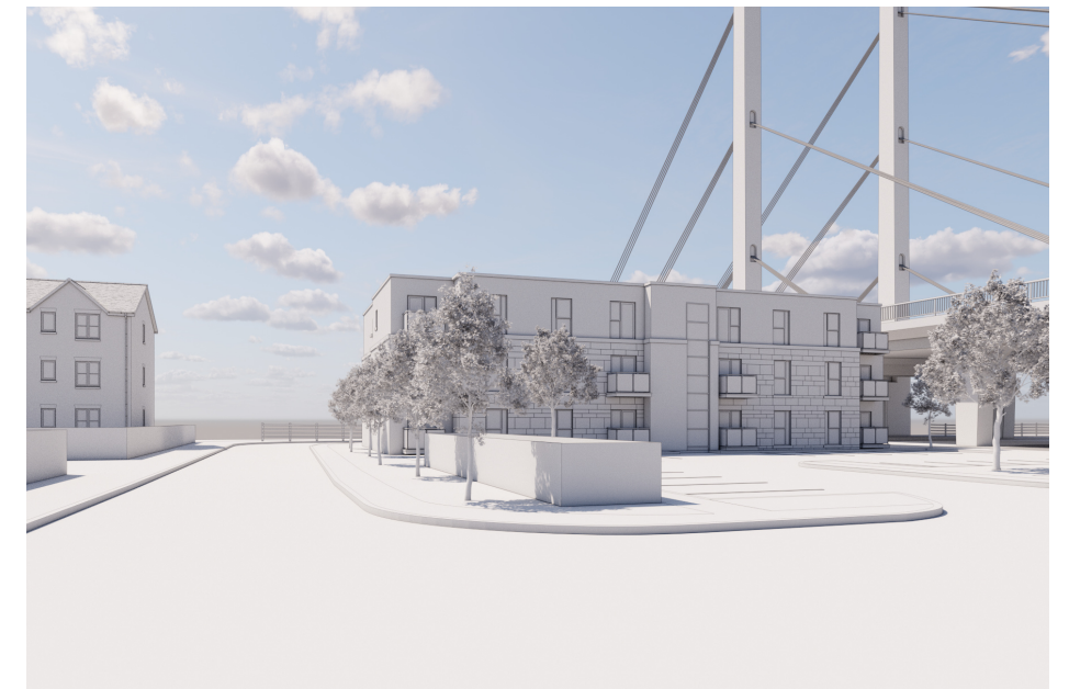
3 Storey comparison