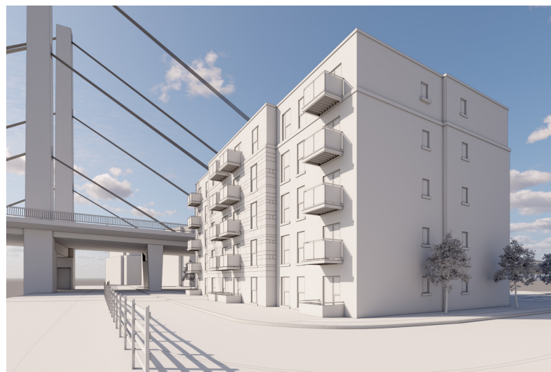
View 2 Location 2