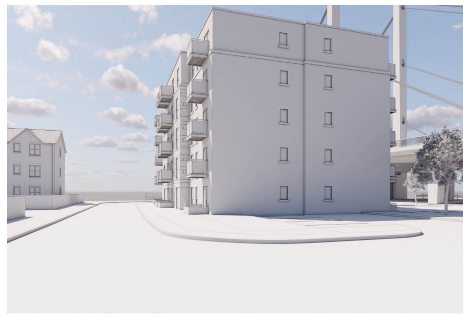
5 Storey as proposed