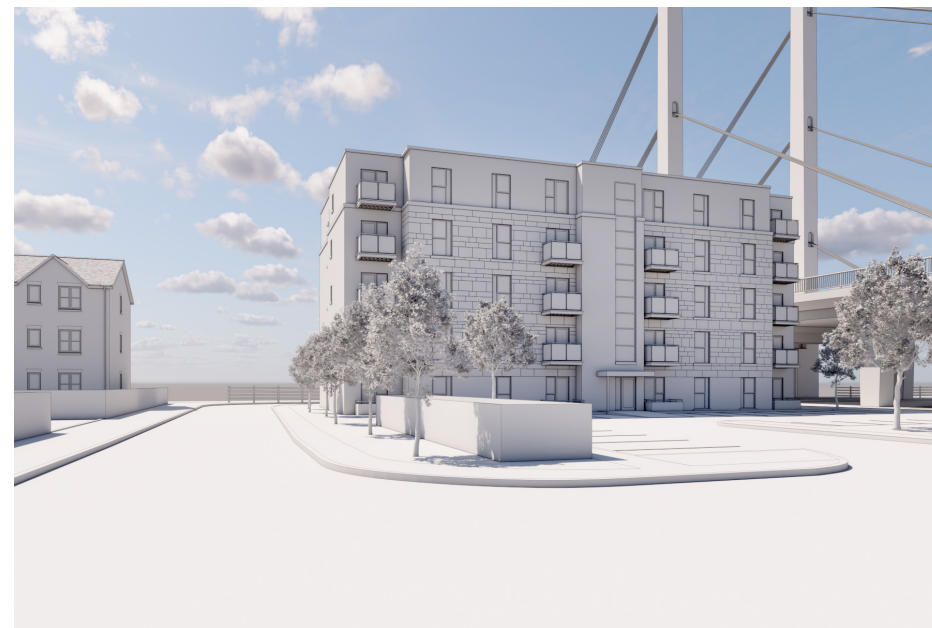
5 Storey as proposed