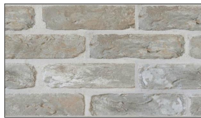
Product :- Taylor Maxwell Brick Colour:- Gormley Grey