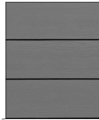
Product :- Horizontal Fibre Cement Cladding. Colour:- Grey Slate