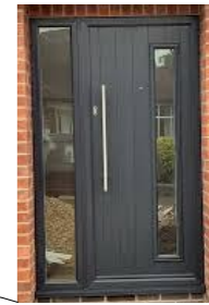
Product :- Example Composite PAS 24 Rear Door Colour:- Anthracite Grey & Black