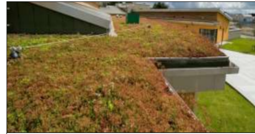
Product :- Bauder or SIM Green Roof System (Flats only)