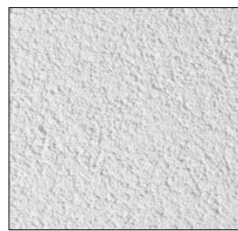
Product :- Painted Texture Sand/Cement Render on Render Board Colour:- Grey