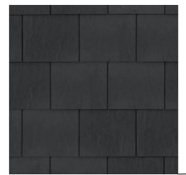
Product :- Cedral Thrutone Textured fibre cement slates. (TBC) Colour:- Blue-Black