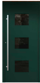
Product :- Example Composite PAS 24 Front Door Colour:- Anthracite Grey & Black