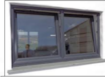
Product :- UPVC Casement Window Company:- TBC Colour:- Anthracite Grey