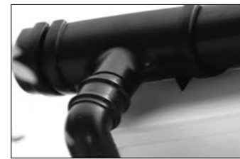
Product :- Guttering & Downpipe Colour:- Black UPVC