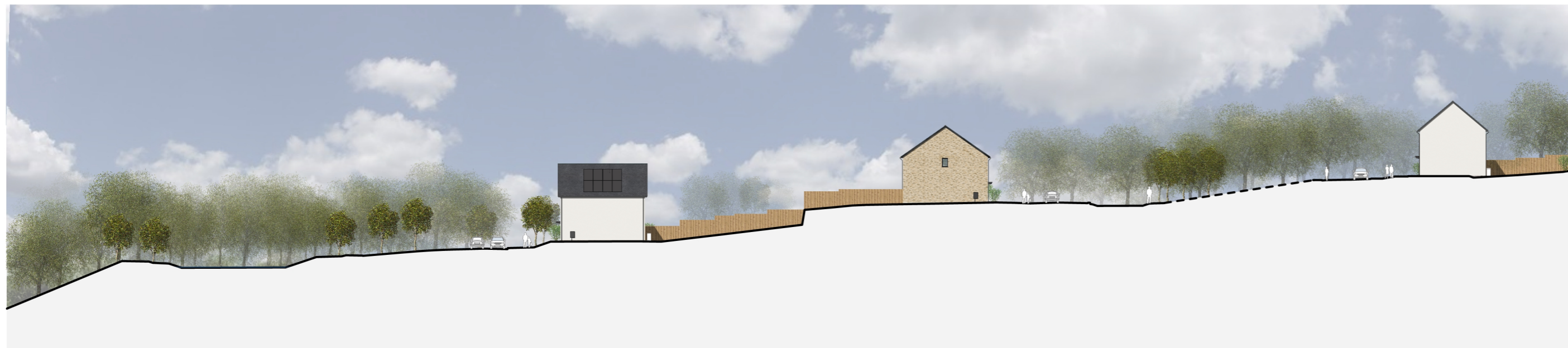
SECTION A-A WEST TO EAST