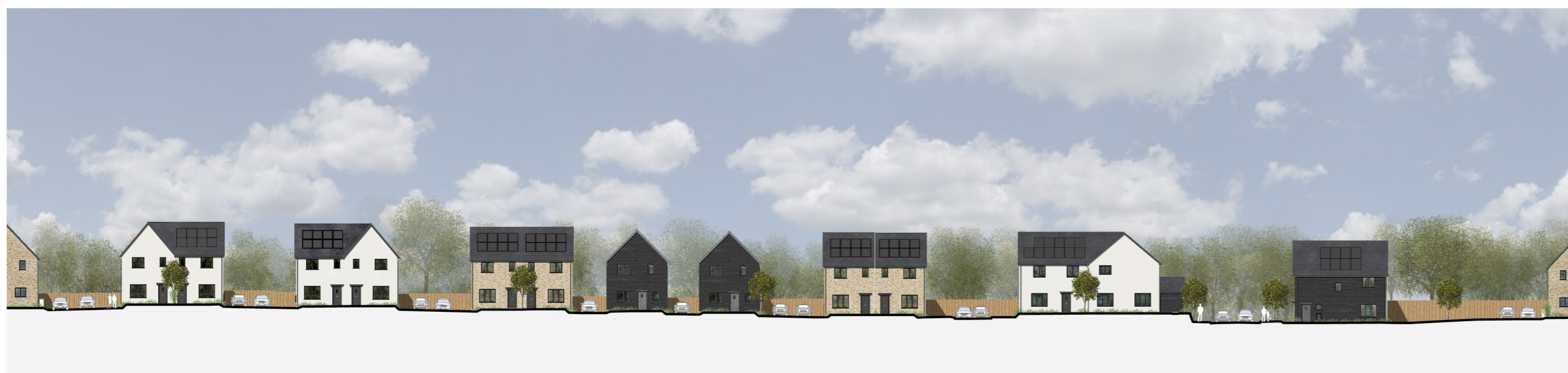
SECTION C-C SOUTH TO NORTH