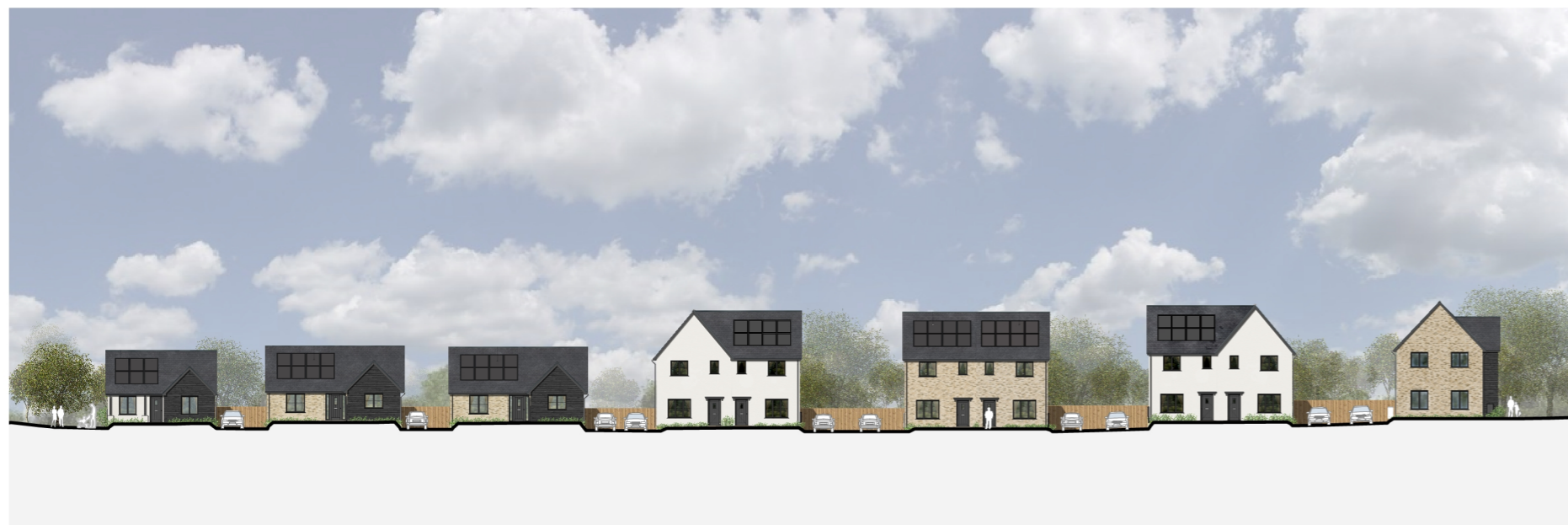
SECTION B-B NORTH TO SOUTH