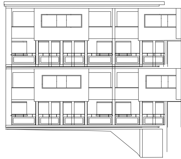
South Inner Elevation