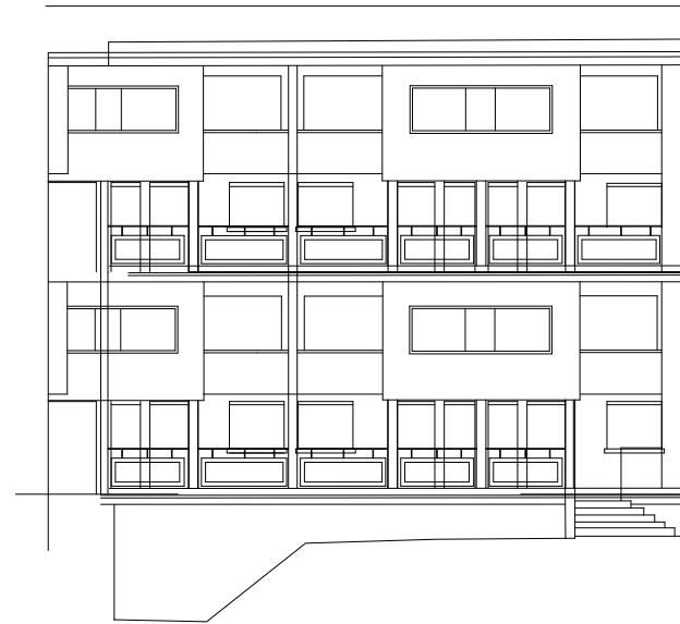
North Inner Elevation