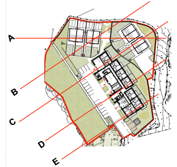
Key Plan Section Location

NOTES: NOT FOR SITE PURPOSES: This drawing is a general arrangement plan only and is not intended for site purposes. SCALE: Do not scale from this drawing. SETTING OUT: All setting out, levels, dimensions to be agreed on site. Do not use the information on this drawing without checking all dimensions on site. Any discrepancies between drawings, specifications and site works are to be reported to The Urbanists. Order of construction and setting out is to be agreed on site. CHECK: This drawing must be the latest revision, read in conjunction with all other drawings, details, specifications and schedules. All dimensions are in millimetres unless otherwise stated. Where and contradiction or uncertainty arises between the drawings and/or the schedule of works, it is the contractor's responsibility to seek verification from The Urbanists before proceeding. No claims will be met by The Urbanists, where the contractor continues work in absence of such confirmation.