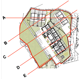
Key Plan Section Location

NOTES: NOT FOR SITE PURPOSES. This drawing is a general arrangement plan only and is not intended for site purposes. SCALE: Do not scale from this drawing. SETTING OUT: All setting out, levels, dimensions to be agreed on site. Do not use the information on this drawing without checking all dimensions on site. Any discrepancies between drawings, specifications and site works are to be reported to The Urbanists. Order of construction and setting out is to be agreed on site. CHECK: This drawing must be the latest revision, read in conjunction with all other drawings, details, specifications and schedules. All dimensions are in millimetres unless otherwise stated. Where and contradiction or uncertainty arises between the drawings and/or the schedule of works, it is the contractor's responsibility to seek verification from The Urbanists before proceeding. No claims will be met by The Urbanists, where the contractor continues work in absence of such confirmation.