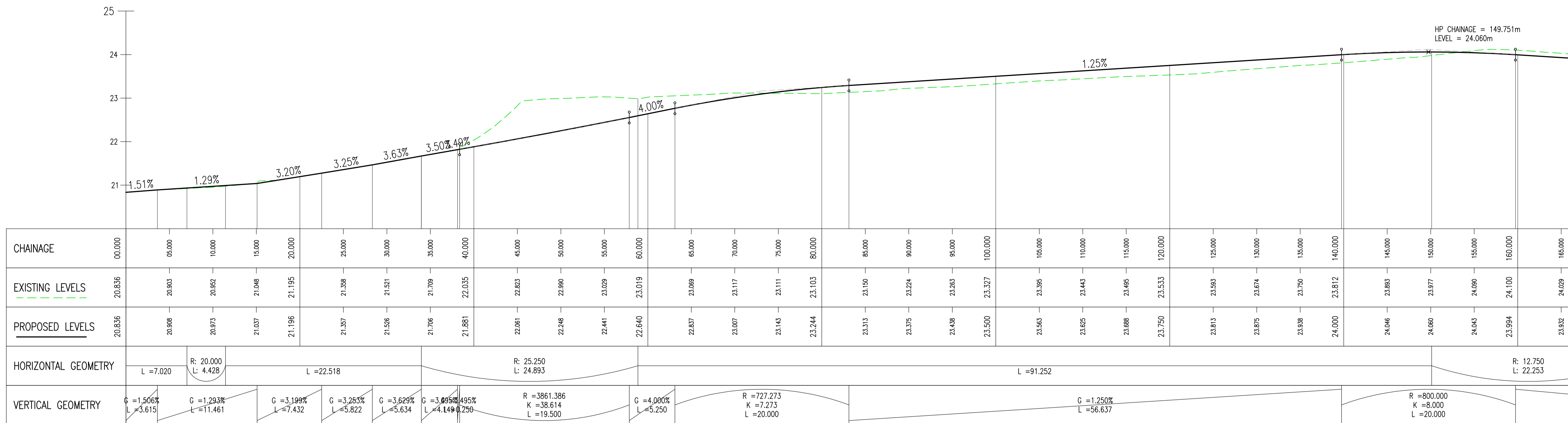
RD1 - LONGSECTION SCALE: H 1:250, V 1:50.