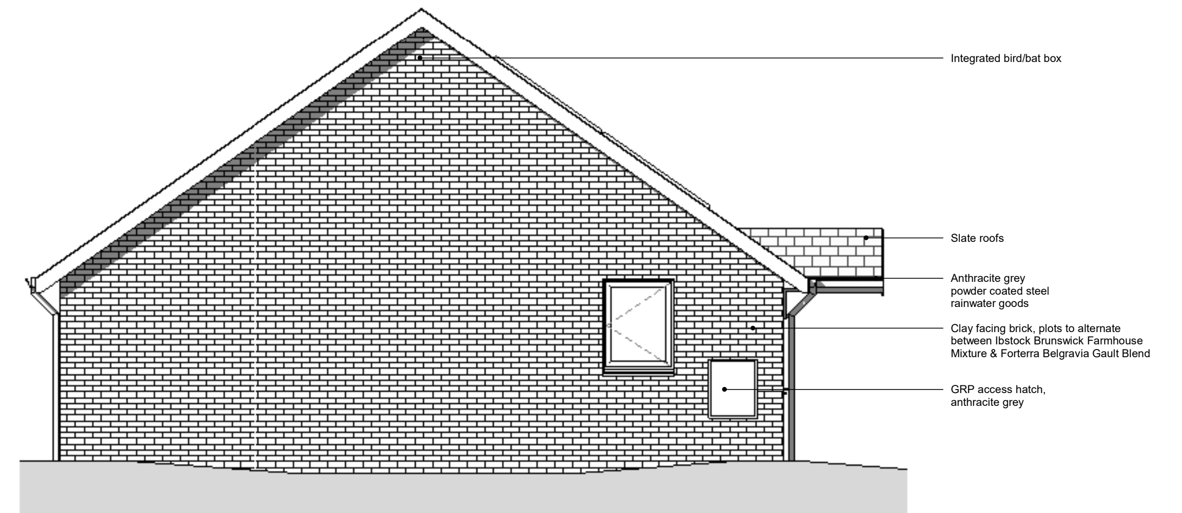
Side 2 as Proposed 1 : 50

"The external lighting on the dwellings shall be restricted to use of downlighters or cowed or hooded luminaires angled downwards preventing light spill above the horizontal plane and there shall be no direct or indirect illumination of adjacent woodland, trees, hedgerows or bat mitigation features including roost entrances (including bat boxes) and flightlines. Bulbs emitting light from the warm-white colour spectrum only (<2700K) with a peak wavelength exceeding 550nm shall be used. Lighting to the rear of properties shall be controlled using PIR motion sensors set to a maximum of 1 minute and angled to prevent accidental triggering."