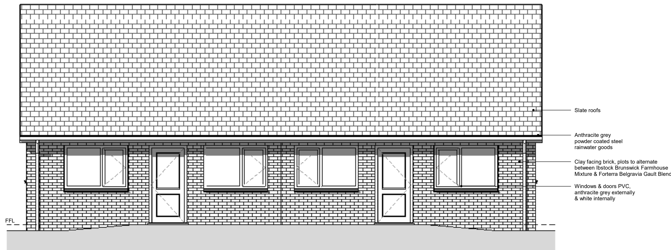
Rear Elevation as Proposed 1 : 50