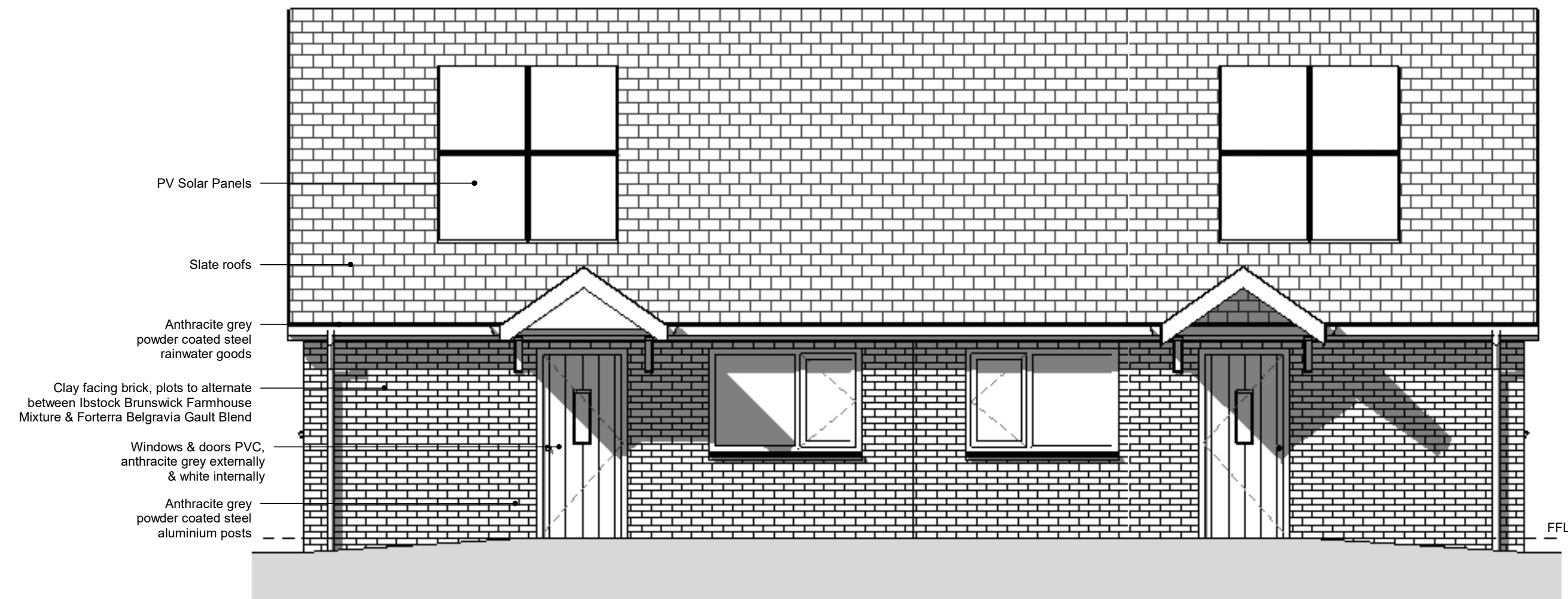
Front Elevation as Proposed 1 : 50