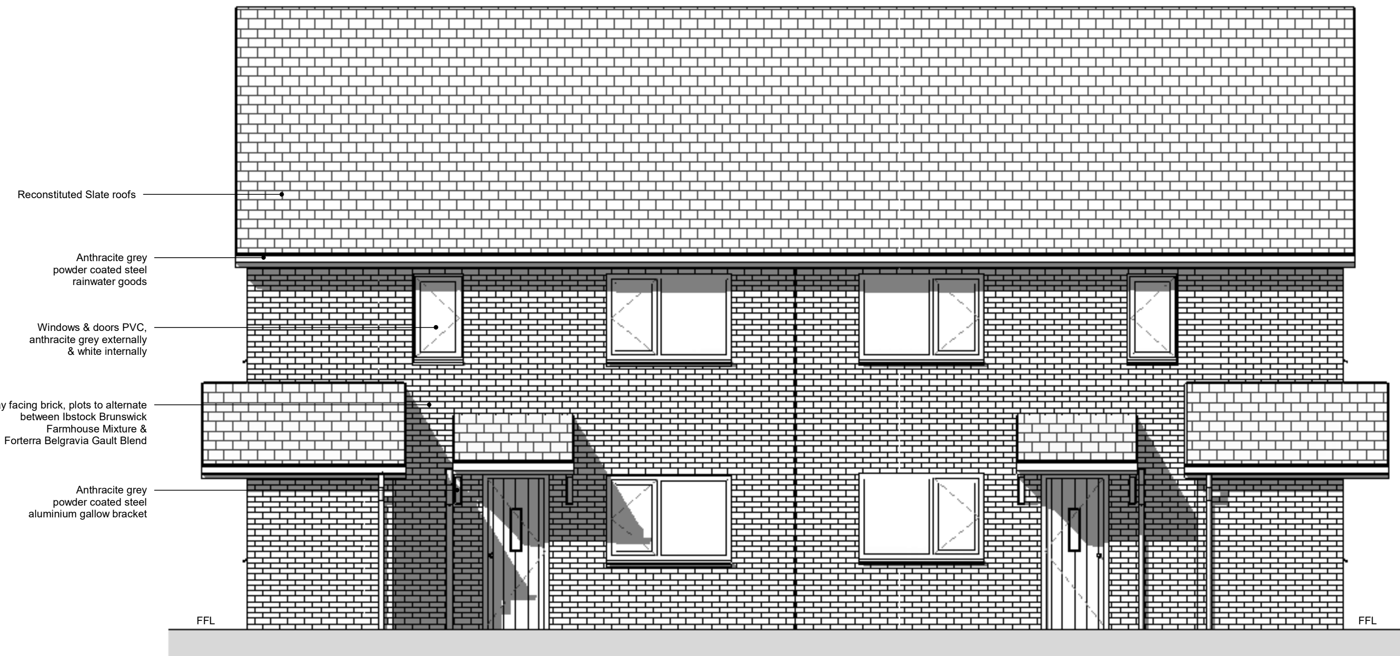
Front Elevation as Proposed