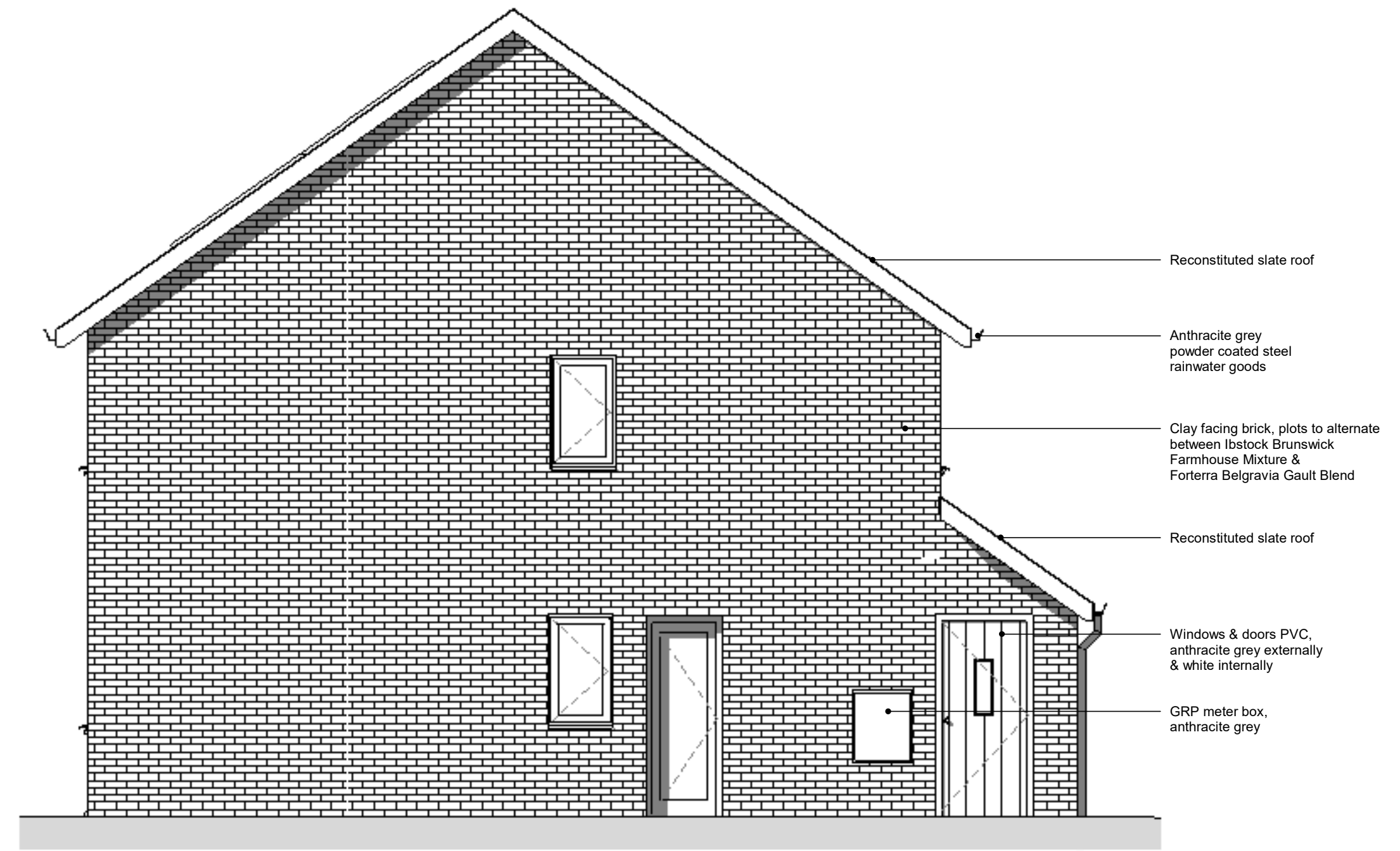
Side 1 as Proposed