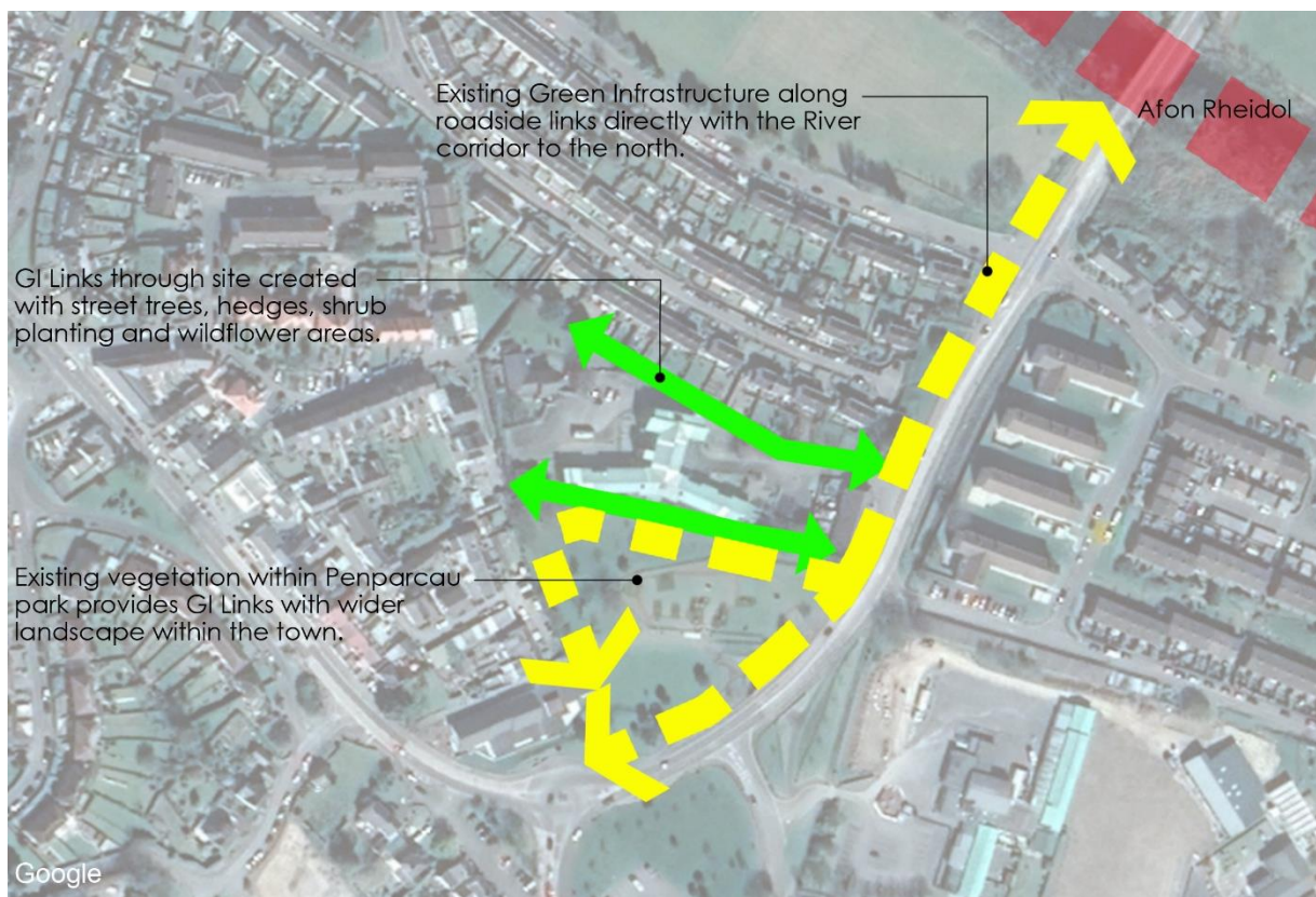
Figure 01 – Design Principles.

Due to the nature of the proposed development, a large proportion of the site will be taken up by the buildings and the associated access roads and parking, however, the proposed layout creates areas of green space which will be maximised to meet the GI objectives.