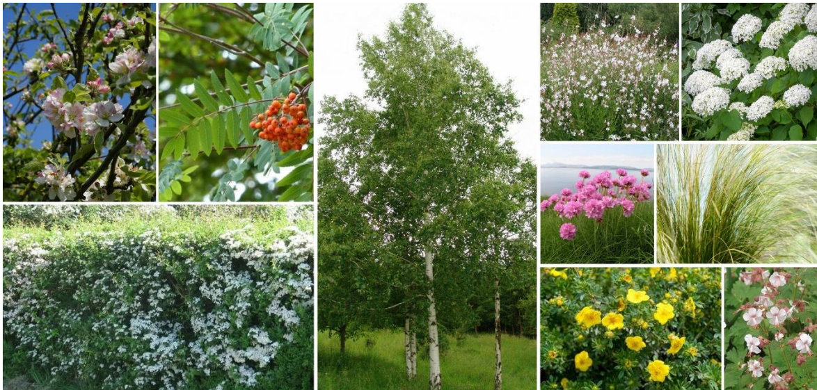
Native trees, hedges and shrubs known to benefit wildlife.

The combined effect of the above measures will be the creation of a species rich landscape, appropriate to the scale and nature of the proposed development.