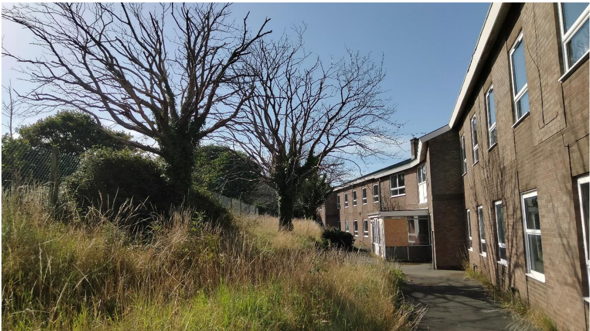
View west showing existing building, existing dead trees within a grassy embankment.

The site will be enhanced by the introduction of new native tree planting, native hedge planting, new shrubs including plants known to benefit wildlife, wildflower meadow areas and other habitat types.