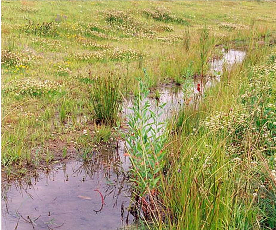
'RE3 River Floodplain' by Germinal Seeds or similar.

This gives us an excellent opportunity at surface level to create rich wetland and grassland habitats capable of holding water on site. This will improve and manage water quality, enhance biodiversity as well as providing amenity for the people using the site.