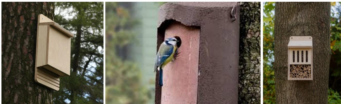
Bat boxes, bird boxes and invertebrate refugia.

In addition to the habitats created through the planting design, the site will also include other ecological measures. Bat and bird boxes will be installed on the new building.