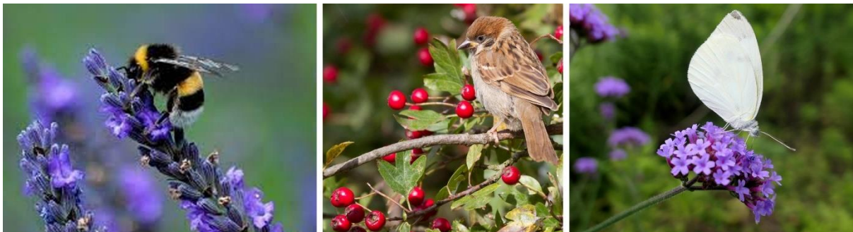
Landscape features to benefit people and wildlife.

The combination of the above measures will enhance biodiversity across the site and demonstrates every effort is being made to create a multi-functional landscape.