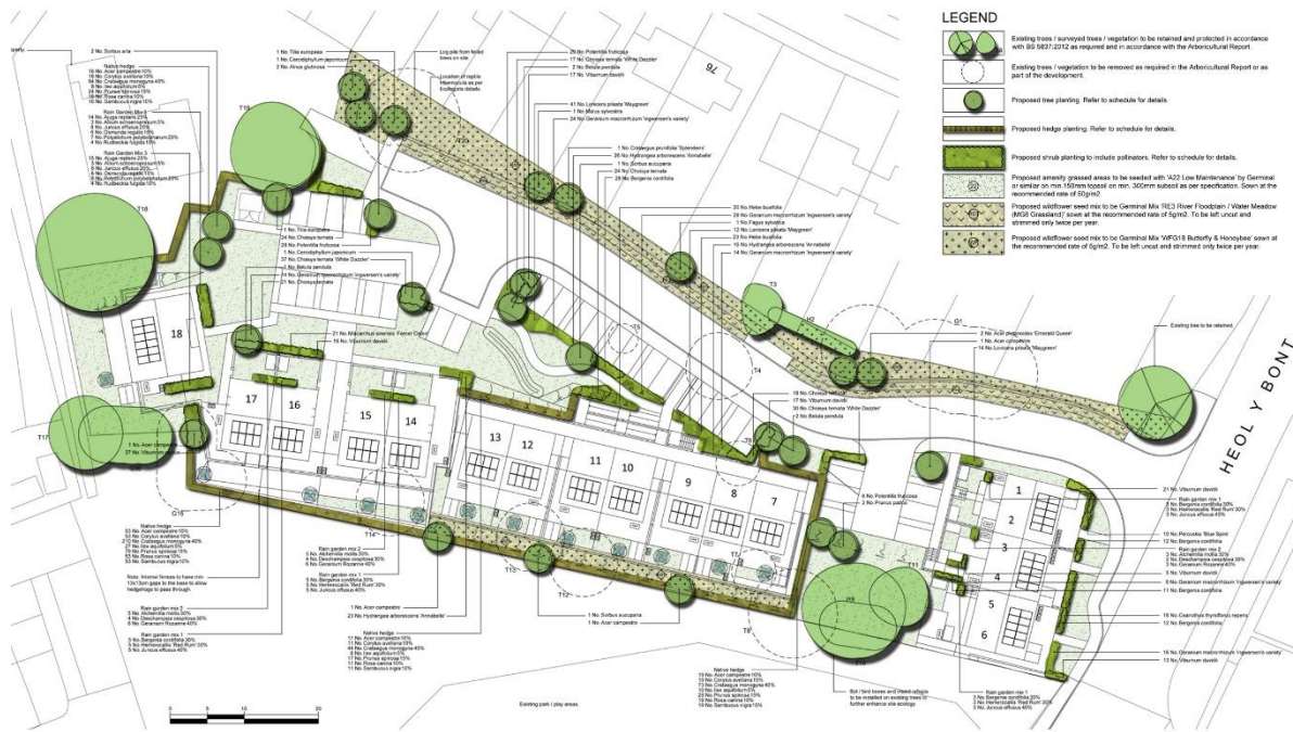
Figure 02 - Extract from DPLA drawing 1194.01

An extract of the soft landscape proposals drawing is copied below and clearly describes the design intent for the planting areas.