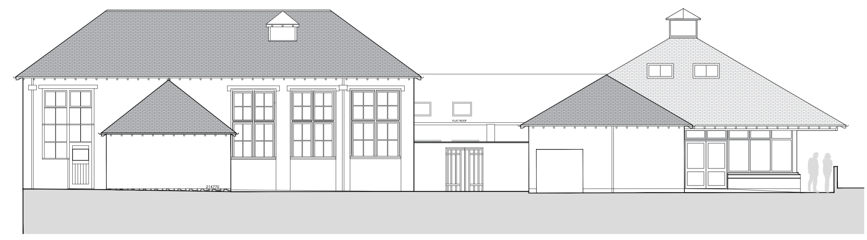
2 ELEVATION 020 WEST SCALE 1:100