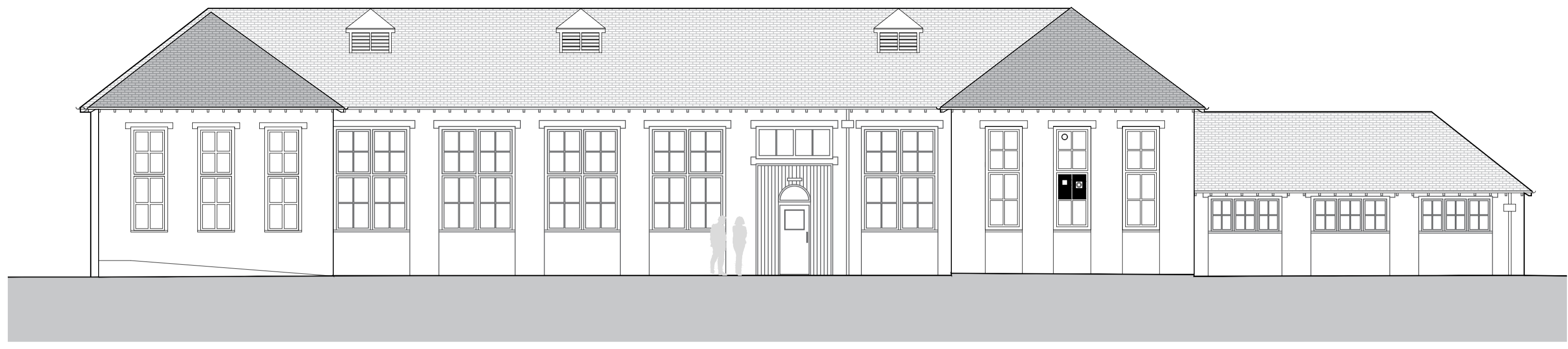
1 ELEVATION 020 NORTH SCALE 1:100

NOTE: THIS DRAWING IS SUBJECT TO COPYRIGHT ALL DIMENSIONS SHALL BE CHECKED ON SITE AND THE ARCHITECT SHALL BE NOTIFIED OF ANY DISCREPANCIES PRIOR TO WORK COMMENCING. PLANS HAVE BEEN BASED ON CAD DATA PROVIDED BY THE CLIENT WHICH HAS NOT BEEN CHECKED FOR ACCURACY NOTES: