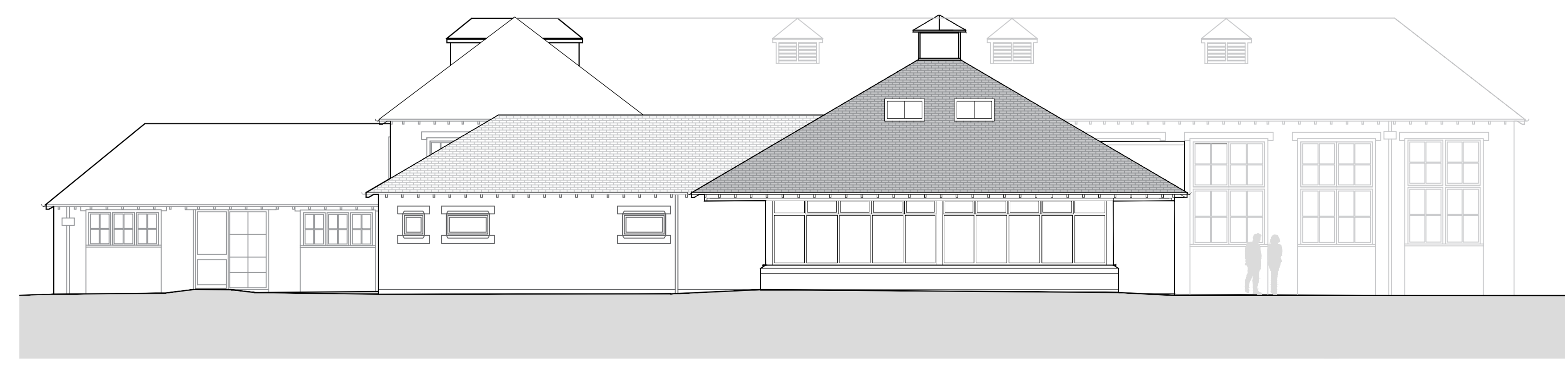
4 ELEVATION 020 SOUTH SCALE 1:100