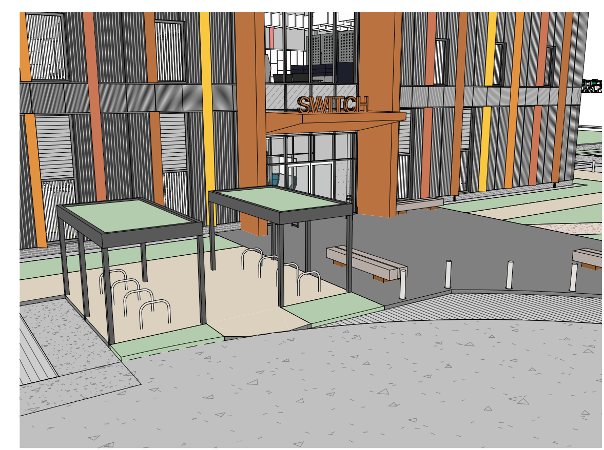
3D View 02 - Front Entrance Area