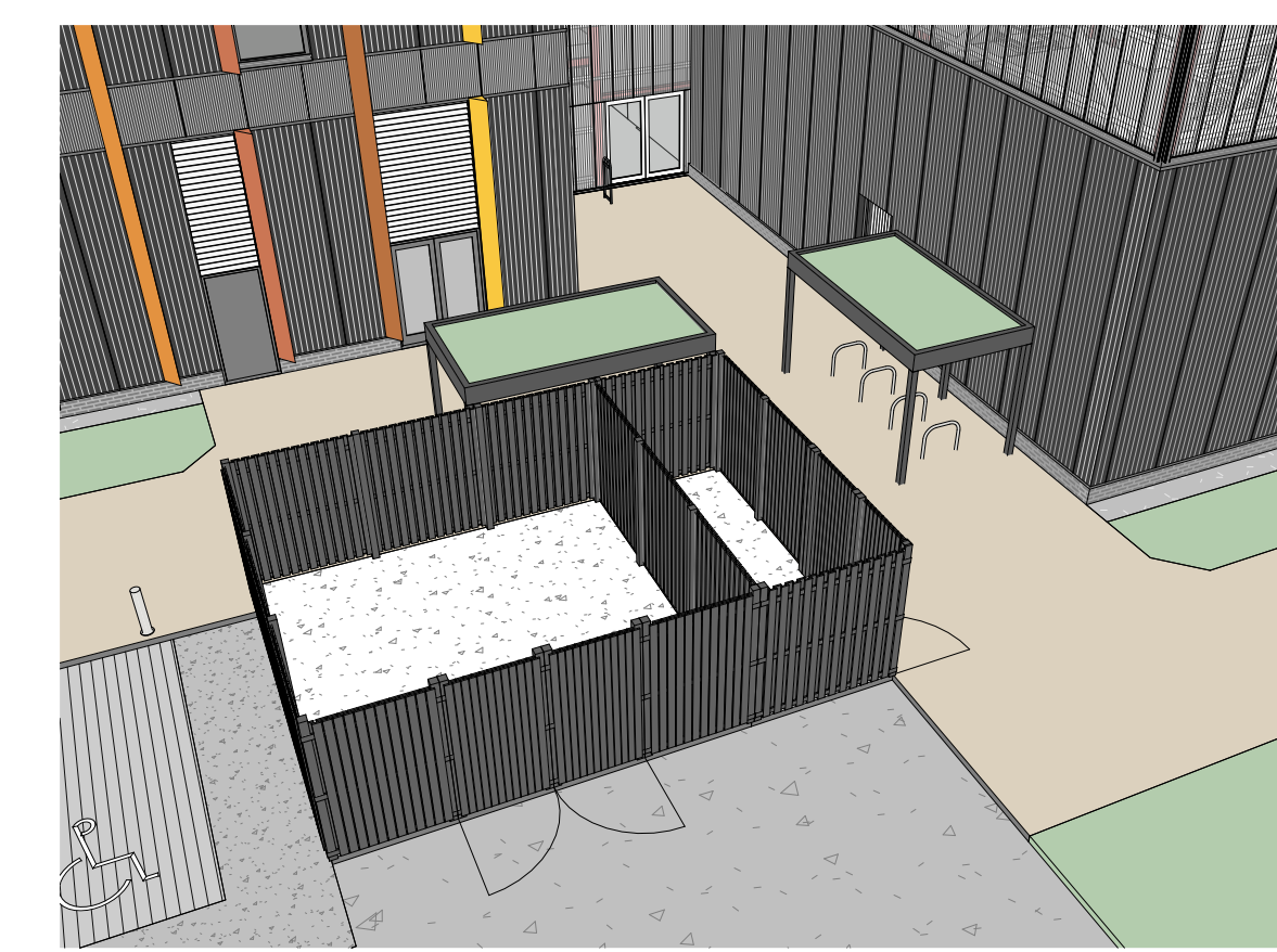
3D View 01 - Substation & Bin Store