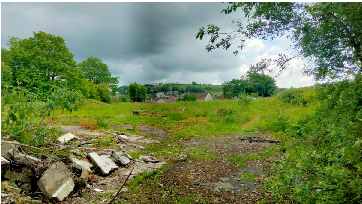
View south east looking across the site towards properties on Beacons View.

The site will be further enhanced by the introduction of new native tree planting, native hedge planting, new shrubs including plants known to benefit wildlife, wildflower meadow areas and other habitat types.