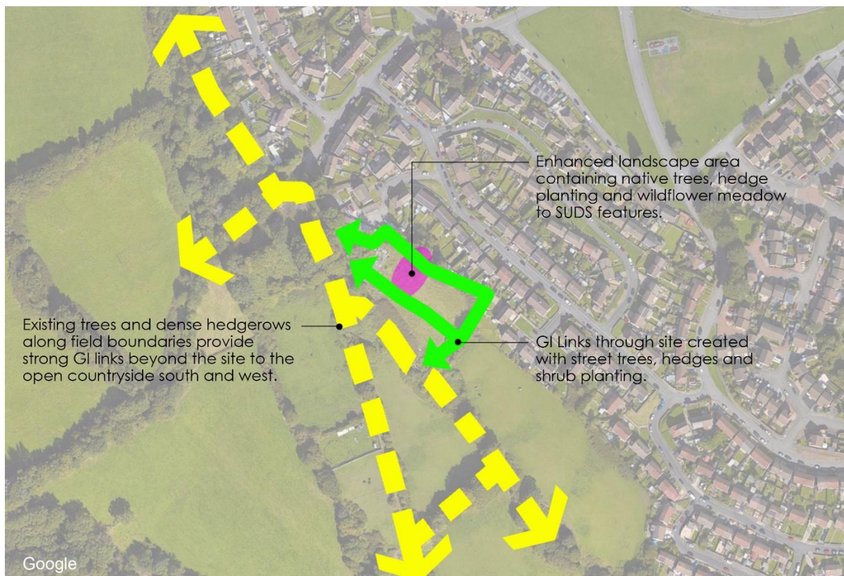
Figure 01 – Design Principles.

Due to the nature of the proposed development, a proportion of the site will be taken up by the buildings and the associated access roads and parking, however, the proposed layout creates areas of green space which will be maximised to meet the GI objectives.