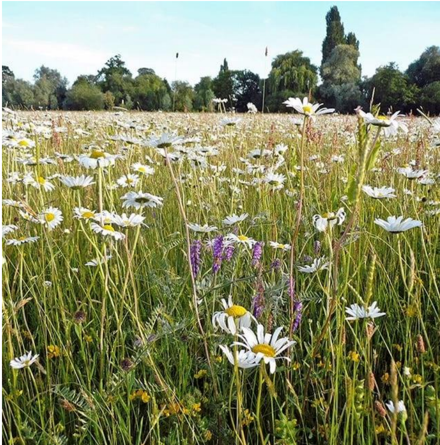
'EM8 Meadow Mixture for Wetlands' by Emorsgate Seeds or similar.

This gives us an excellent opportunity at surface level to create rich wetland and grassland habitats capable of holding water on site. This will improve and manage water quality, enhance biodiversity as well as providing amenity for the people using the site.