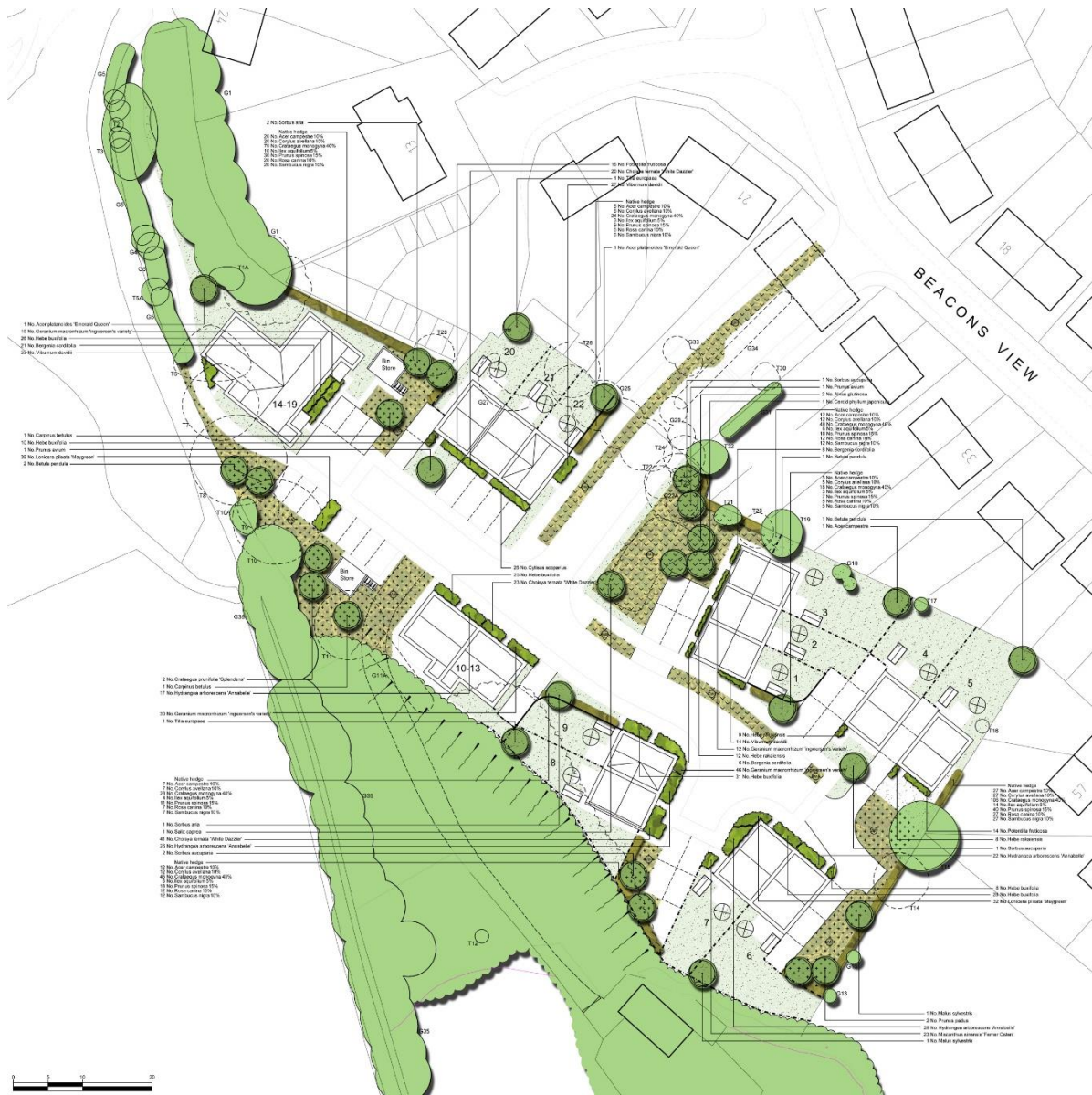
Figure 02 - Extract from DPLA drawing 1222.01

An extract of the soft landscape proposals drawing is copied below and clearly describes the design intent for the planting areas.