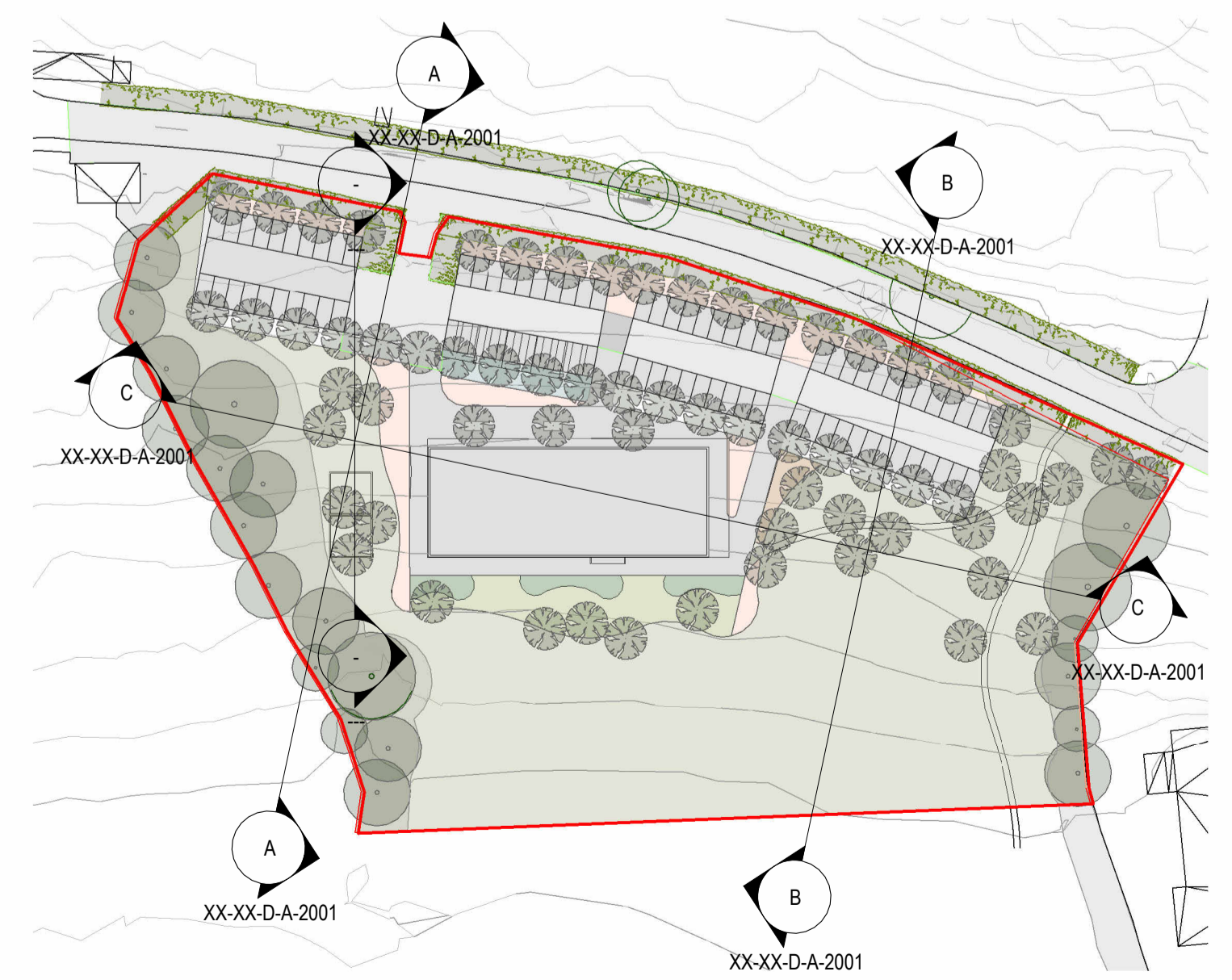
1 Parameter Section Key 1 : 1000

BUILDING DESIGN PARTNERSHIP SHALL HAVE NO RESPONSIBILITY FOR ANY USE MADE OF THIS DOCUMENT OTHER THAN FOR THAT WHICH IT WAS PREPARED AND ISSUED. ALL DIMENSIONS SHOULD BE CHECKED ON SITE. DO NOT SCALE FROM THIS DRAWING ANY DRAWING ERRORS OR DIVERGENCIES SHOULD BE BROUGHT TO THE ATTENTION OF BUILDING DESIGN PARTNERSHIP AT THE ADDRESS SHOWN BELOW. DRAWINGS SHALL BE READ IN CONJUNCTION WITH THE FOLLOWING BEFORE WORK COMMENCES: • THE CDM DESIGN ISSUES REGISTER • THE BDP RISK SERIES OF DRAWINGS • THE PROJECT CDM RISK REGISTER